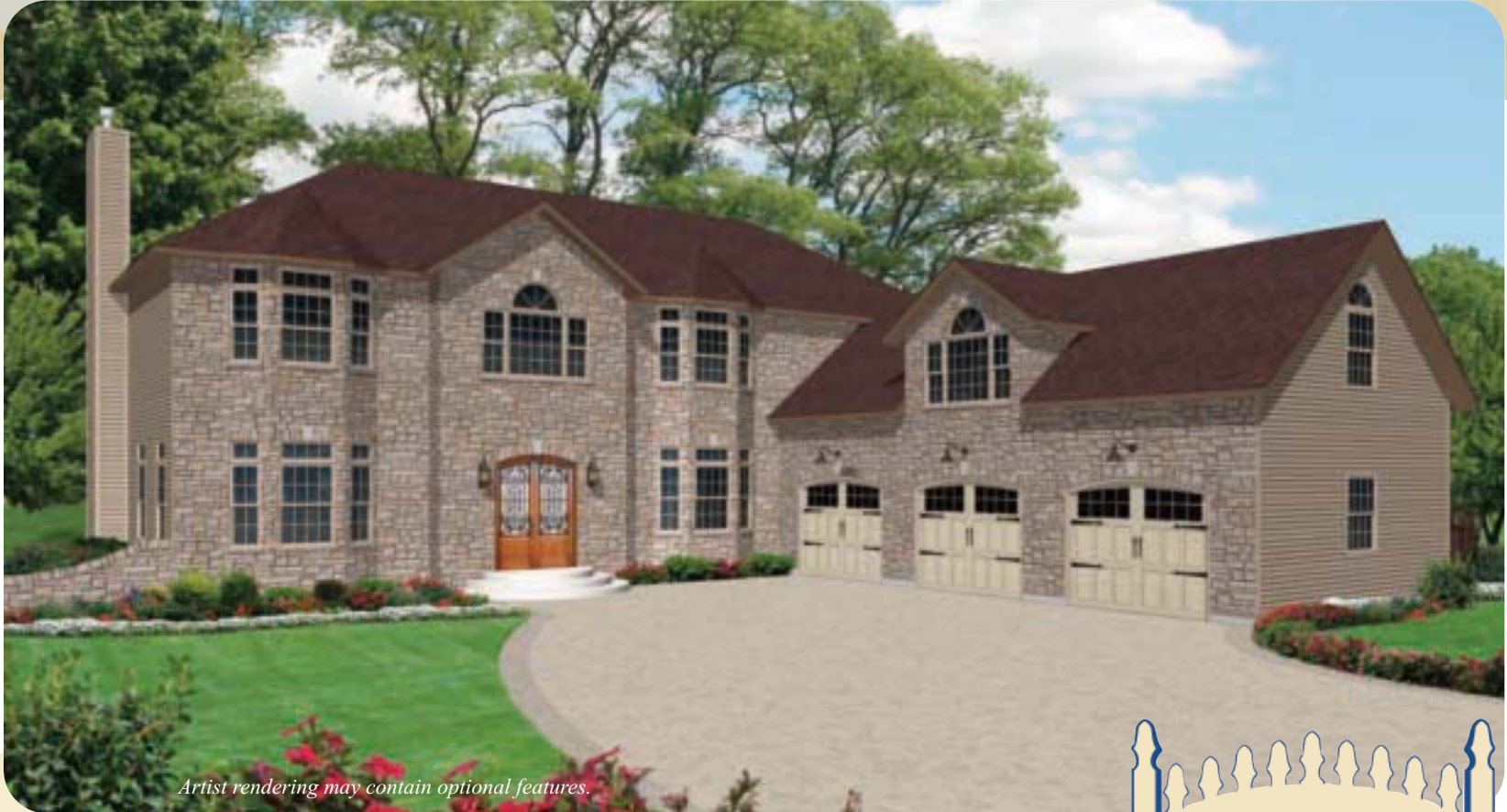
Artist rendering may contain optional features.