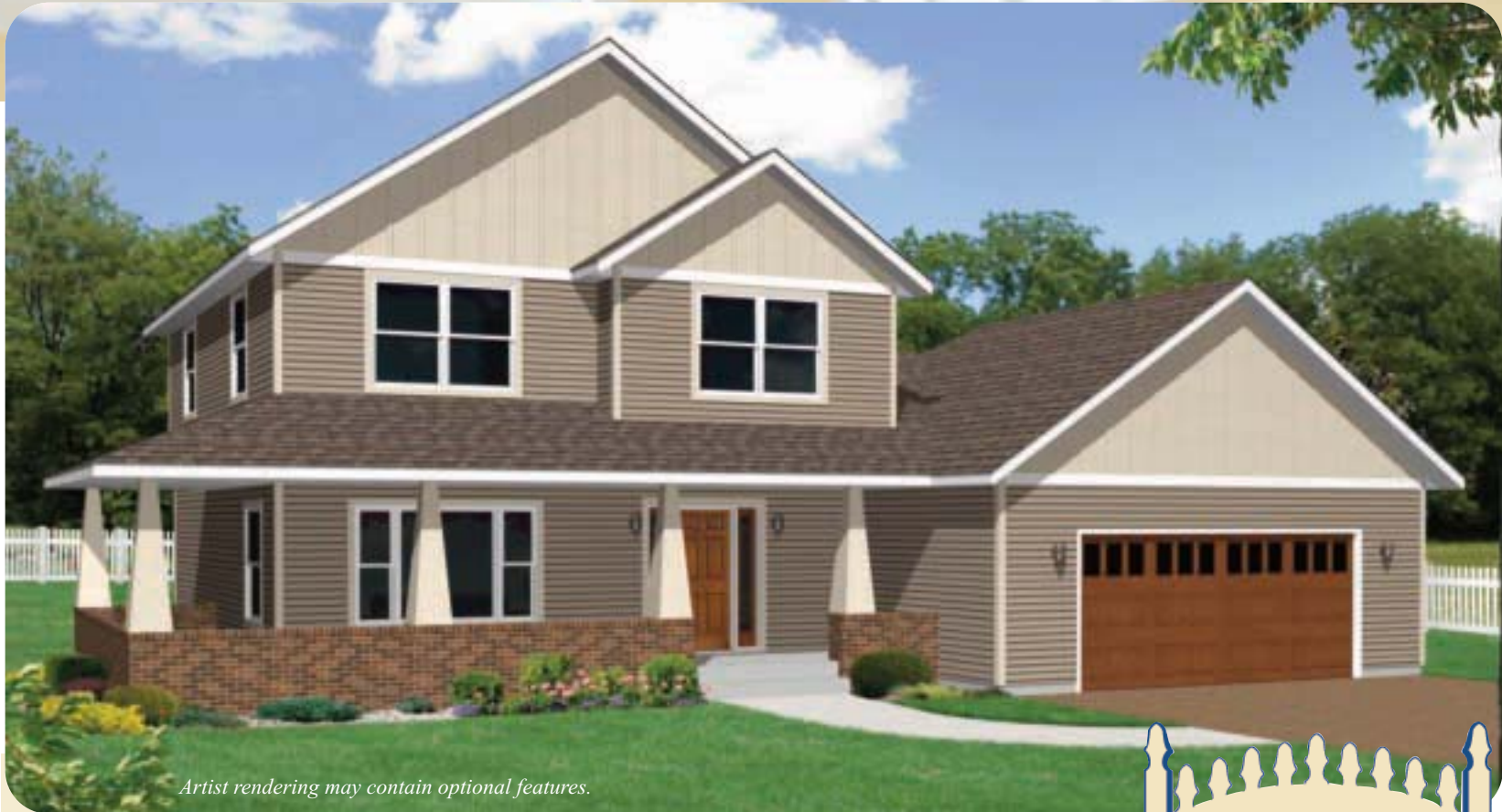
Artist rendering may contain optional features.